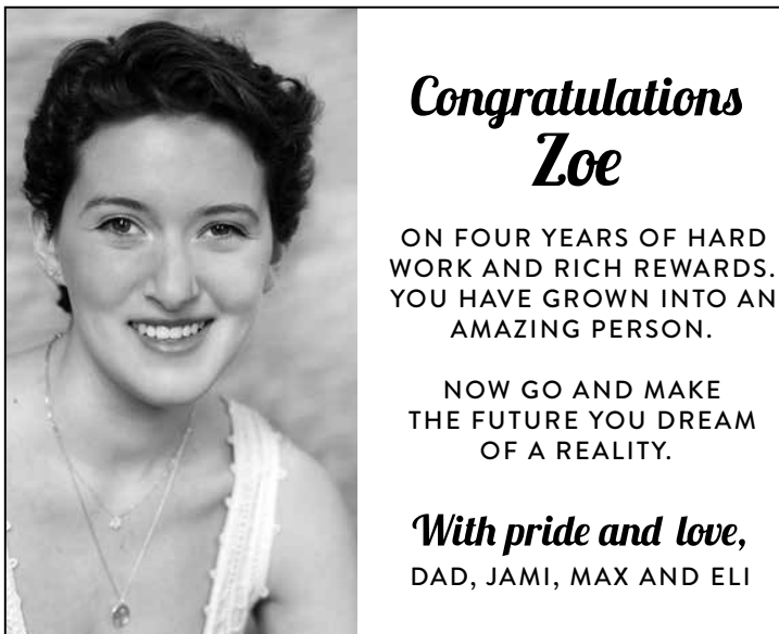
Quarter-Page Template Ad Example